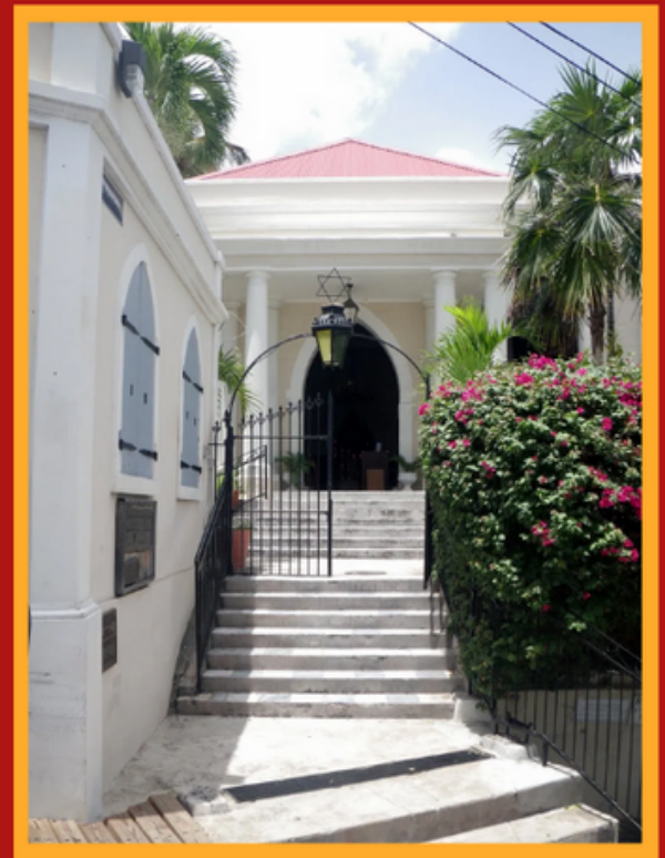
Hebrew Congregation of St. Thomas

Register at InstituteofJewishExperience.org